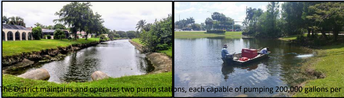
The District maintains and operates two pump stations, each capable of pumping 200,000 gallons per minute.

CSID monitors and adjusts the water levels in 22 miles of canals, and is responsible for maintenance therein. The District keeps vegetation growth in the canals under control through chemical and biological (natural) methods, and routinely removes debris of all kinds from canals.